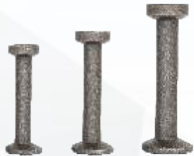
Concrete recess formed by casting of SIL Recess Formers